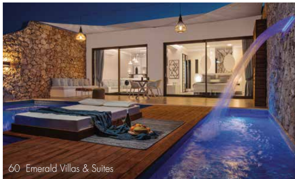
60 Emerald Villas & Suites