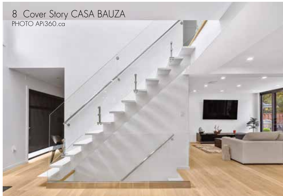
8 Cover Story CASA BAUZA