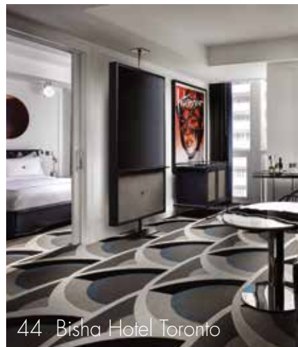
44 Bisha Hotel Toronto